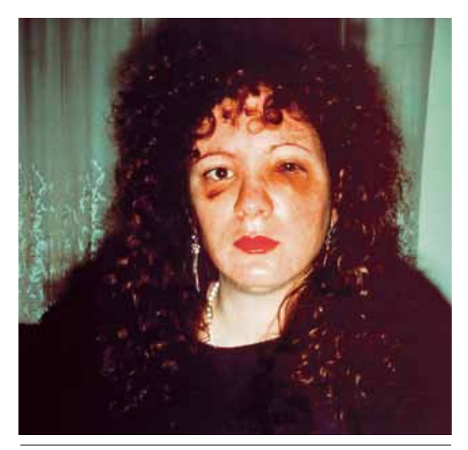
Nan Goldin: "Nan, one month after being battered (1984)". "[Nan Goldin's] use of high contrast, her impulsive compositions, and notably, her early move to color photography at a time (1973) when art photography was still largely synonymous with black and white indicate the cultivation of a self-conscious amateurish or vernacular style, a pleasing sloppiness that combines subtle aesthetic mastery with the appeal of the best off-kilter snapshot from a night of drunken carousing." Zurmomskis, Catharine, "Snapshot Photography: The Lives of Images", Cambridge: MIT Press, 2013, p. 246.